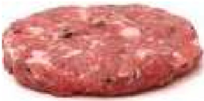
HAMBURGUEZA OVALADA 75G REF. 1620 UXC: 38 UdM: P