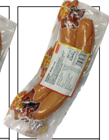
SUPER CERVELA 2U 240G REF. 1623 UXC: 6 UdM: P