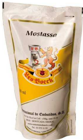
BOLSA MOSTAZA 500ML REF. 1622 UXC: 6 UdM: P