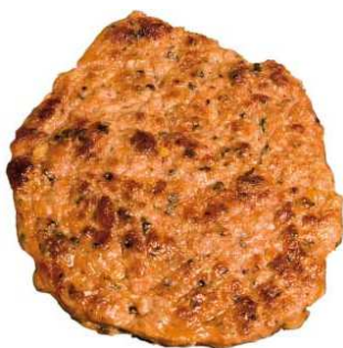
HAMBURGUEZA 4U 400G REF. 1661 UXC: 6 UdM: P