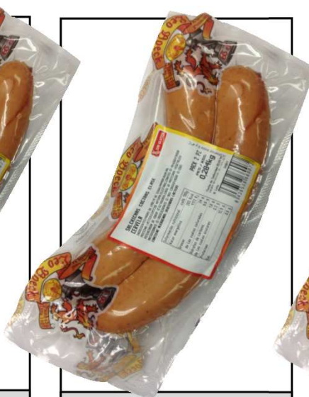
CERVELAS TRIPA NATURAL 2U 240G REF. 1612 UXC: 6 UdM: P