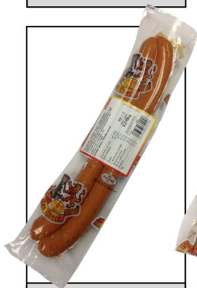
PIKANTWURST 2U 220G REF. 1613 UXC: 6 UdM: P