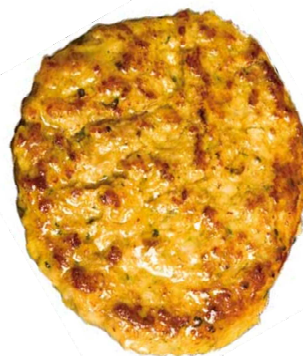
HAMBUR MORUNA 4U 400G REF. 1675 UXC: 6 UdM: P