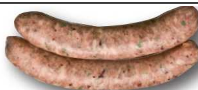
BOTIFARRA CALÇOTS 2U 240G BANDEJA FUERA DE TEMPORADA : 8 UdM: P