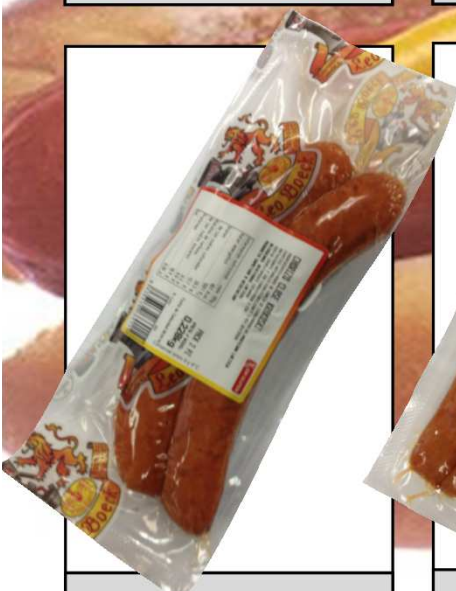
CHORIZO KRAKOSKI 2U 235G REF. 1617 UXC: 6 UdM: P