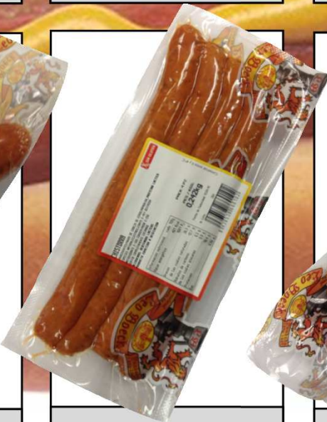
CHISTORRA 4U 250G REF. 1618 UXC: 6 UdM: P