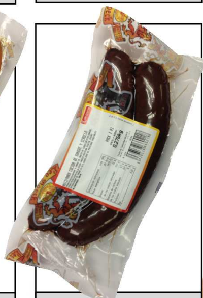
MALAGUENYES 2U 230G REF. 1614 UXC: 6 UdM: P