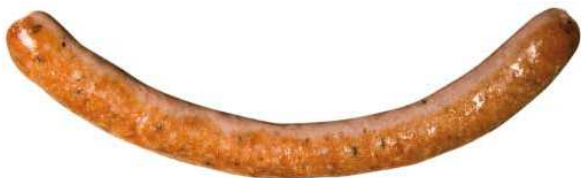
SALCHICHA PAIS 3U 270G BANDEJA REF. 1654 UXC: 8 UdM: P