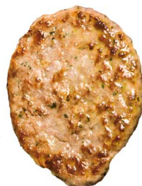
HAMBUR TERNERA 4U 400G REF. 1678 UXC: 6 UdM: P