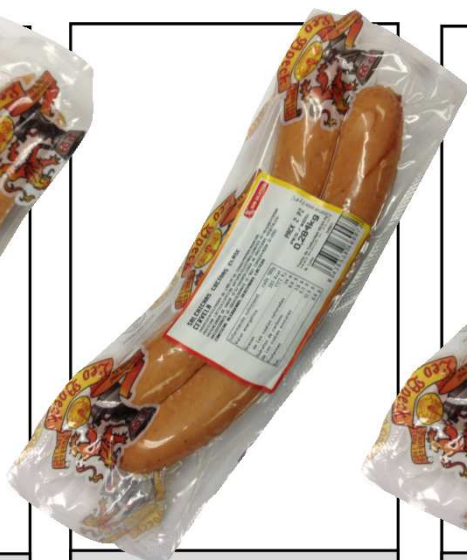
FRANKFURT TRIPA NATURAL 2U 140G REF. 1611 UXC: 6 UdM: P