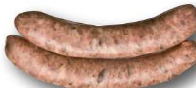
BOTIFARRA DE BOLETS 2U 240G BANDEJA REF. 1658 UXC: 8 UdM: P