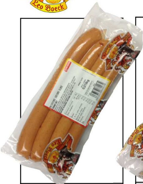
FRANKFURT TRIPA NATURAL 4U 280G REF. 1610 UXC: 6 UdM: P