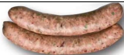
BOTIFARRA ESCALIVADA 2U 240G BANDEJA REF. 1659 UXC: 8 UdM: P