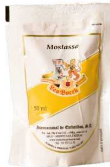
BOLSA MOSTAZA 50ML REF. 1606 UXC: 10 UdM: P