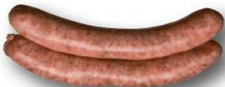
BOTIFARRA 2U 240G BANDEJA REF. 1657 UXC: 8 UdM: P