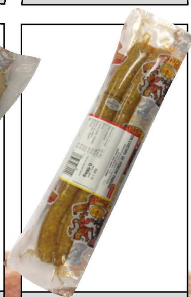
SALCHICHA PINCHO MORUNO 2U 200G REF. 1616 UXC: 6 UdM: P