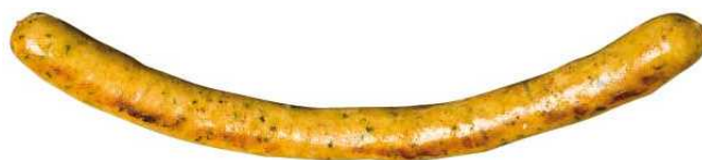
SALCHICHA PINXO 3U 300G BANDEJA REF. 1656 UXC: 8 UdM: P