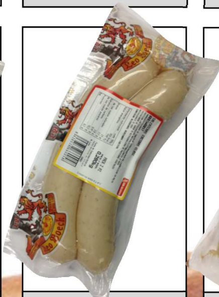
BRATWURST 2U 220G REF. 1615 UXC: 6 UdM: P