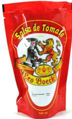
BOLSA TOMATE 500ML REF. 1621 UXC: 6 UdM: P