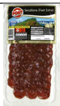
SECALLONA EXTRA 90G REF. 7324 UXC: 15 UdM: P