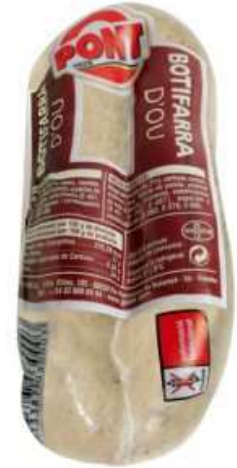
BUTIFARRA D'OU 390G REF. 7331 UXC: 11 UdM: P