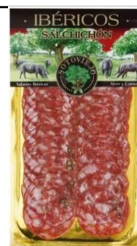
SALCHICHON IBERICO 100G REF. 7334 UXC: 15 UdM: P