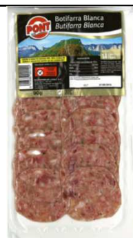
BUTIFARRA BLANCA 90G REF. 7317 UXC: 15 UdM: P