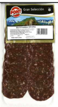
BUTIFARRA NEGRA 90G REF. 7318 UXC: 15 UdM: P