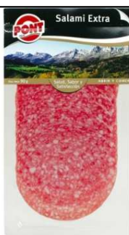
SALAMI 90G REF. 7327 UXC: 15 UdM: P