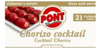
CHORIZO COCKTAIL 200G REF. 7326 UXC: 6 UdM: P