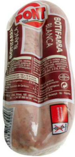
BUTIFARRA BLANCA 300G REF. 7323 UXC: 14 UdM: P