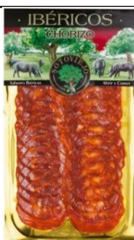
CHORIZO IBERICO 100G REF. 7333 UXC: 15 UdM: P