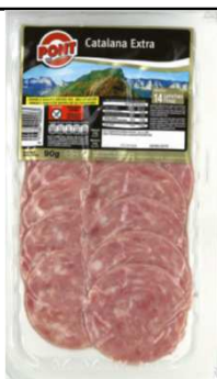
CATALANA EXTRA 90G REF. 7319 UXC: 15 UdM: P