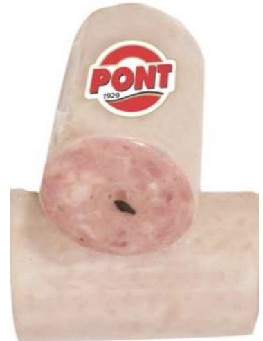
CATALANA TRUFADA 330G REF. 7313 UXC: 8 UdM: P