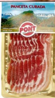
PANCETA CURADA 120G REF. 7307 UXC: 15 UdM: P