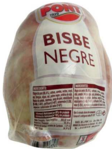
BULL NEGRE 450G REF. 7321 UXC: 5 UdM: P