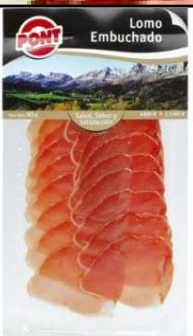
LOMO EMBUCHADO 90G REF. 7328 UXC: 15 UdM: P