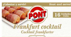
FRANKFURT COCKTAIL MINI 200G REF. 7315 UXC: 6 UdM: P