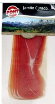
JAMON CURADO 90G REF. 7329 UXC: 15 UdM: P