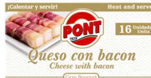
QUESO CON BACON 200G REF. 7312 UXC: 6 UdM: P