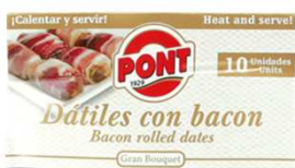
DATILES CON BACON 210G REF. 7325 UXC: 12 UdM: P