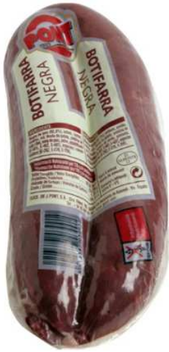
BUTIFARRA NEGRA 300G REF. 7306 UXC: 14 UdM: P