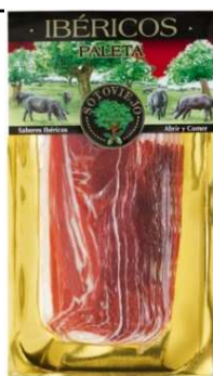
PALETA IBERICA 100G REF. 7322 UXC: 15 UdM: P