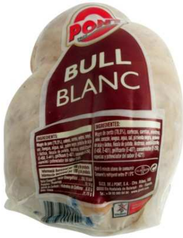
BULL BLANC 450G REF. 7320 UXC: 5 UdM: P